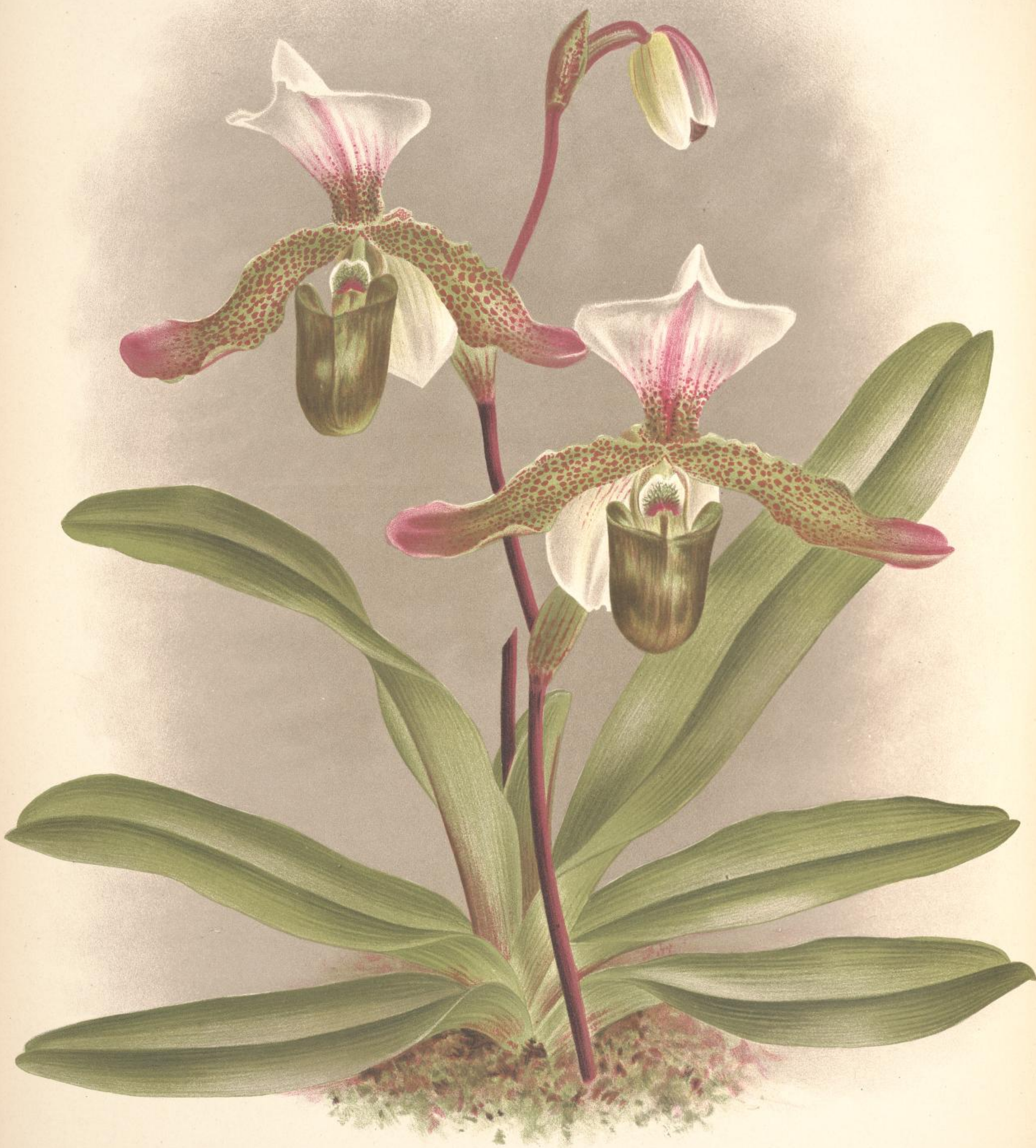
CYPRIPEDIUM X DALLEMAGNEI HORT.