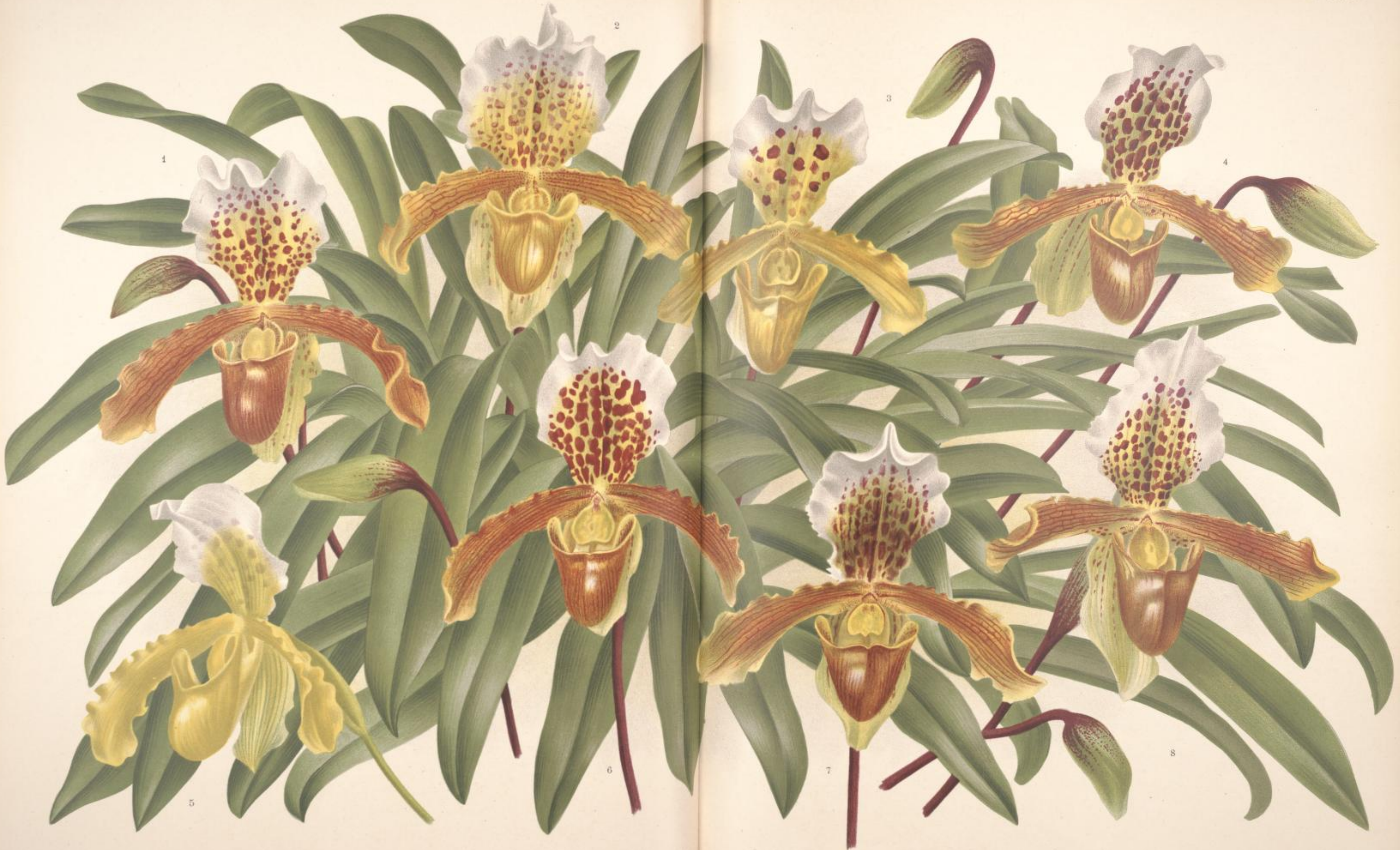
1. EXCELLENS 5. LINDENIAE