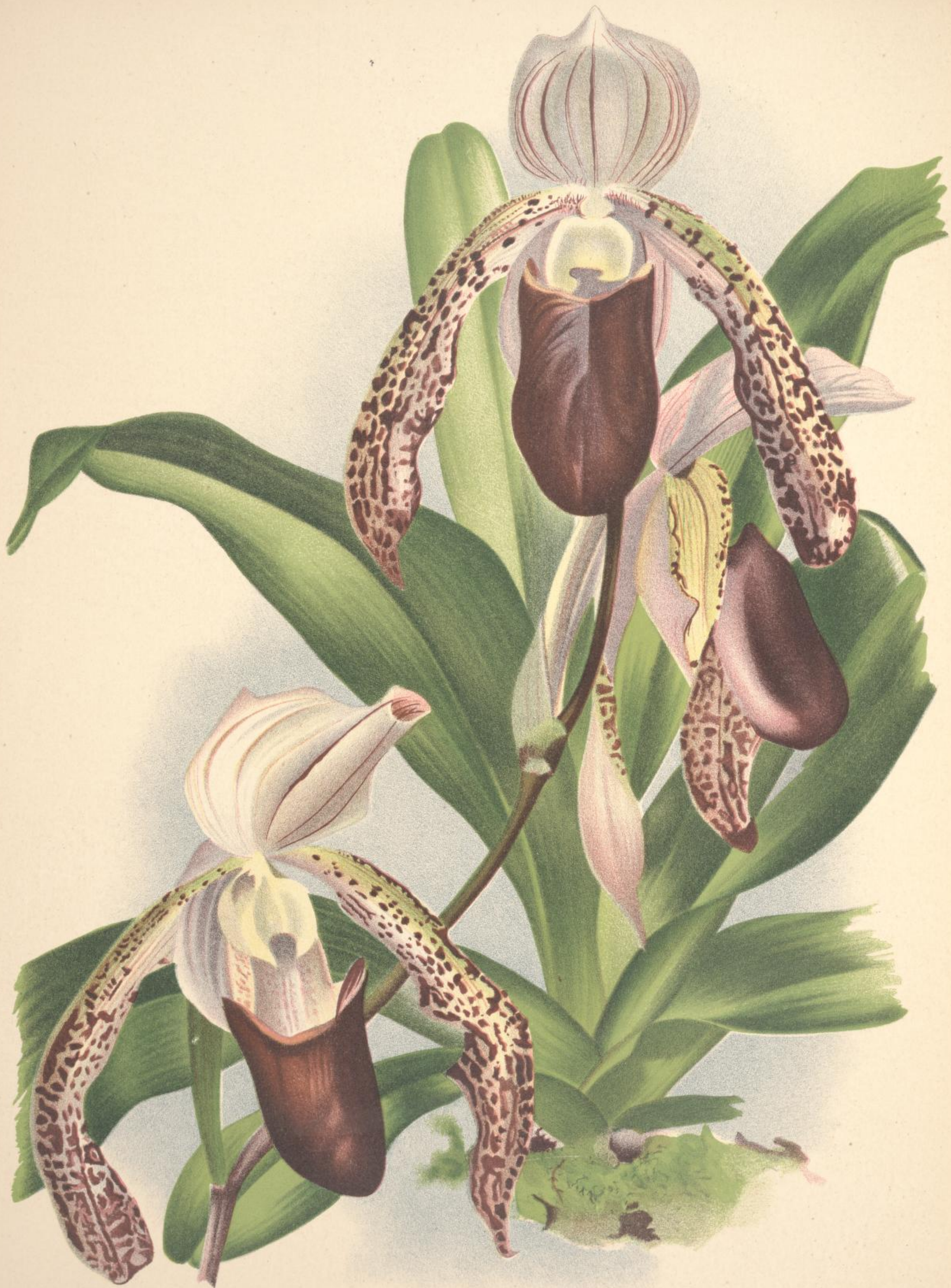
CYPRIPEDIUM × MORGANIAE HORT. var. BURFORDIENSE HORT.