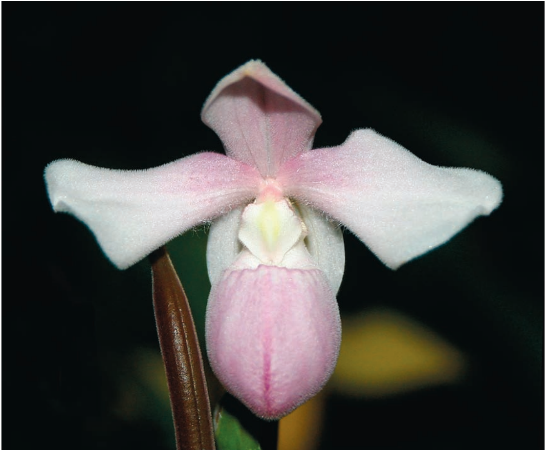
Fig. 2. Phragmipedium andreettae P.J.Cribb & Pupulin. Frontal view of the flower that served as the holotype ( Portilla s.n. , QCA).