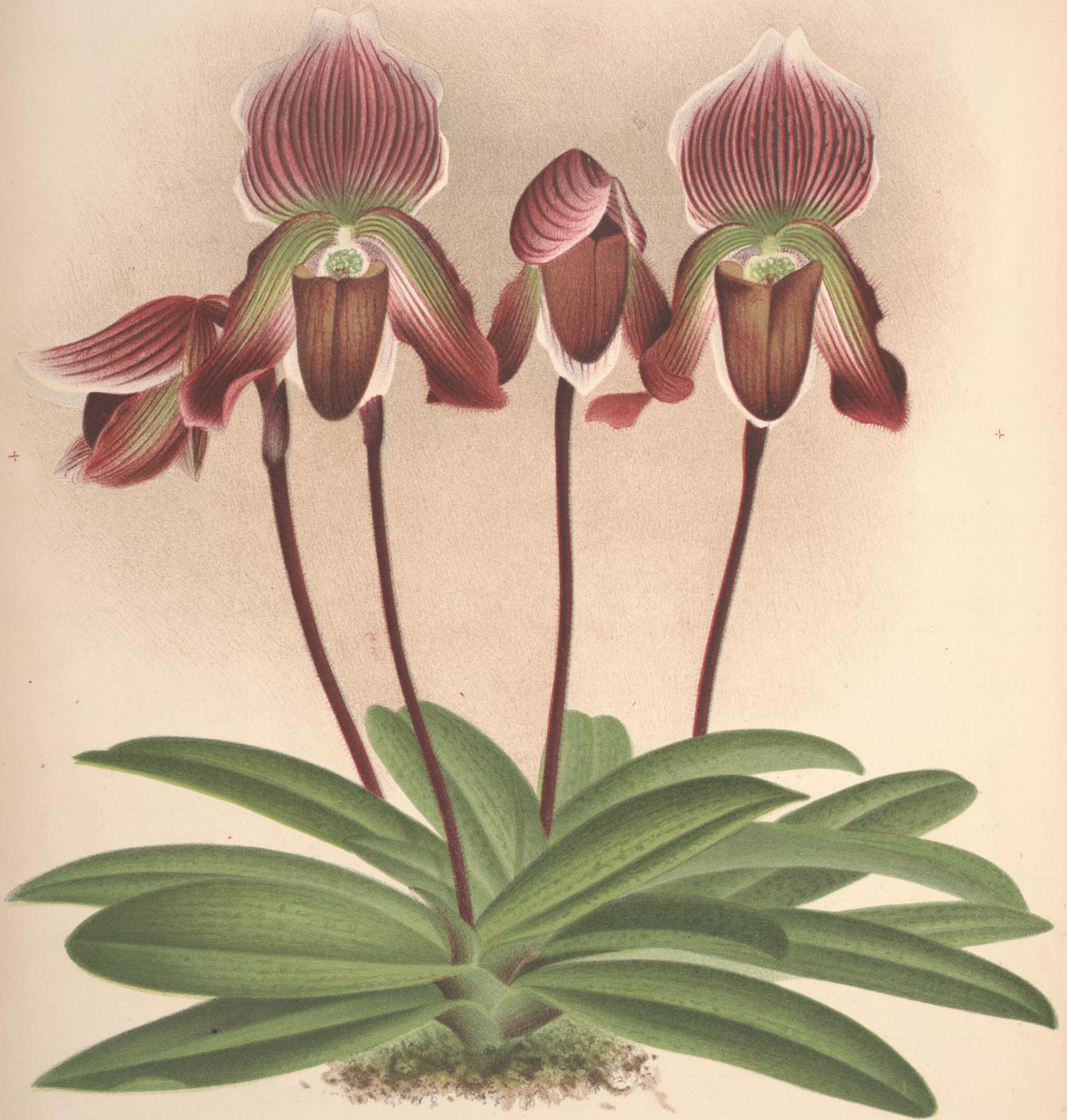
CYPRIPEDIUM X VEXILLARIUM RCHB. F.